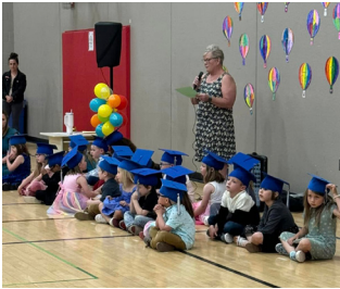
Child Care – Preschool & YKids (School's Day Out)