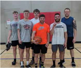
General Membership – Open gym time, fitness classes, etc.