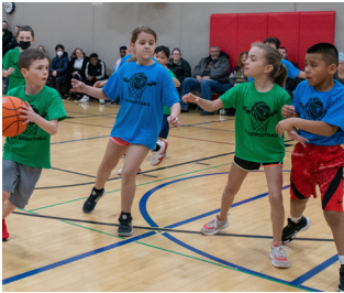
Growing DC Basketball League (5-12 Year Olds) – Over 200 participants