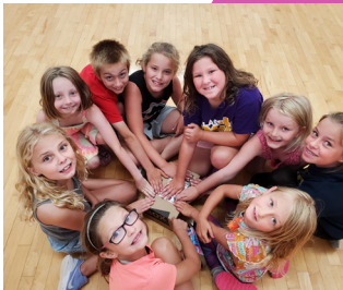
Summer Day Camp – Inclement weather impact