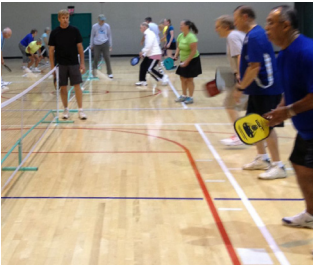
Pickleball – Fastest growing sport in America