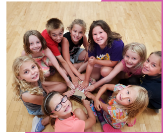
Summer Day Camp – Inclement weather impact