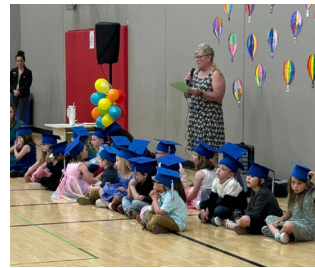
Child Care – Preschool & YKids (School's Day Out)