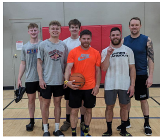
General Membership – Open gym time, fitness classes, etc.