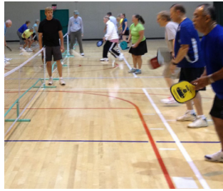
Pickleball – Fastest growing sport in America