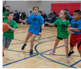
Growing DC Basketball League (5-12 Year Olds) – Over 200 participants